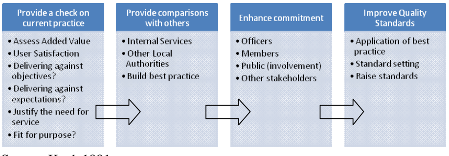
Figure 1: Purpose of an OSC performance Management Framework (adapted from Deming's Improvement Cycle

The use of Performance Management to quantify the impact of O&S provides the following key developments: