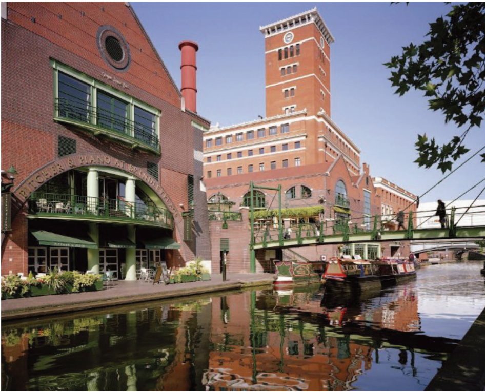
FIGURE 3. The Waters Edge and 3 Brindleyplace.

activities has been soundly based in urban design principles—not just the establishment of an initial plan, but as a continuing process. The essence of the physical and financial models has been a linked sequence of urban spaces (creating both tangible and economic activity as a continuation of the pedestrian spine of the city) and a set of development plots that enclose and define them. Neither of these elements became entrenched as a finite design; the masterplan was not conceived as grand architecture but as an enduring image for a piece of the city—providing both the framework for its evolution and a method for its implementation.