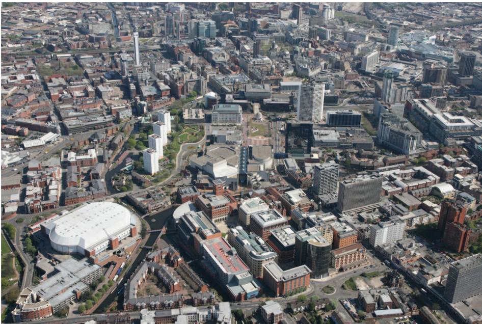
FIGURE 4. Brindleyplace 2009.

Lloyds TSB, and three blocks were occupied by the Royal Bank of Scotland. The Water's Edge was thriving. Two quality restaurants—Bank and Le Petit Blanc—were underpinned by trade from the offices and from concert and conference activity. The site worked as it had been planned.