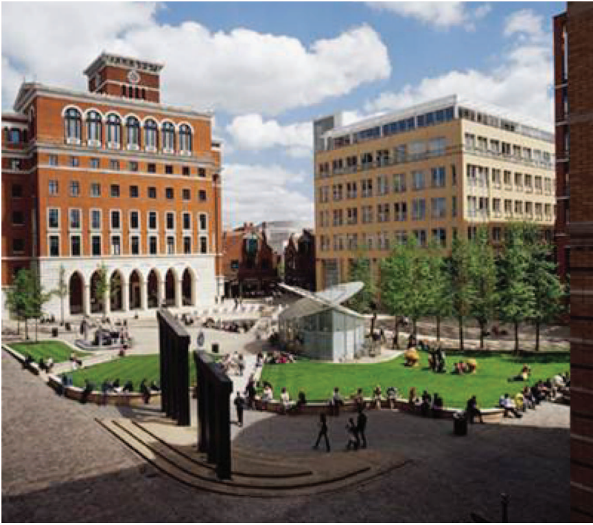
FIGURE 2. Brindleyplace Square.